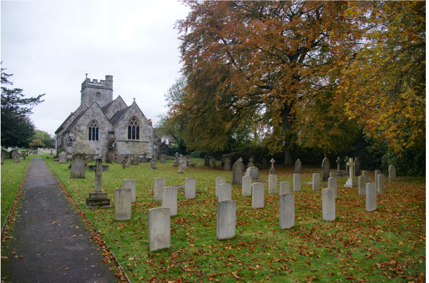
St George's Churchyard, Fovant – War Graves at front